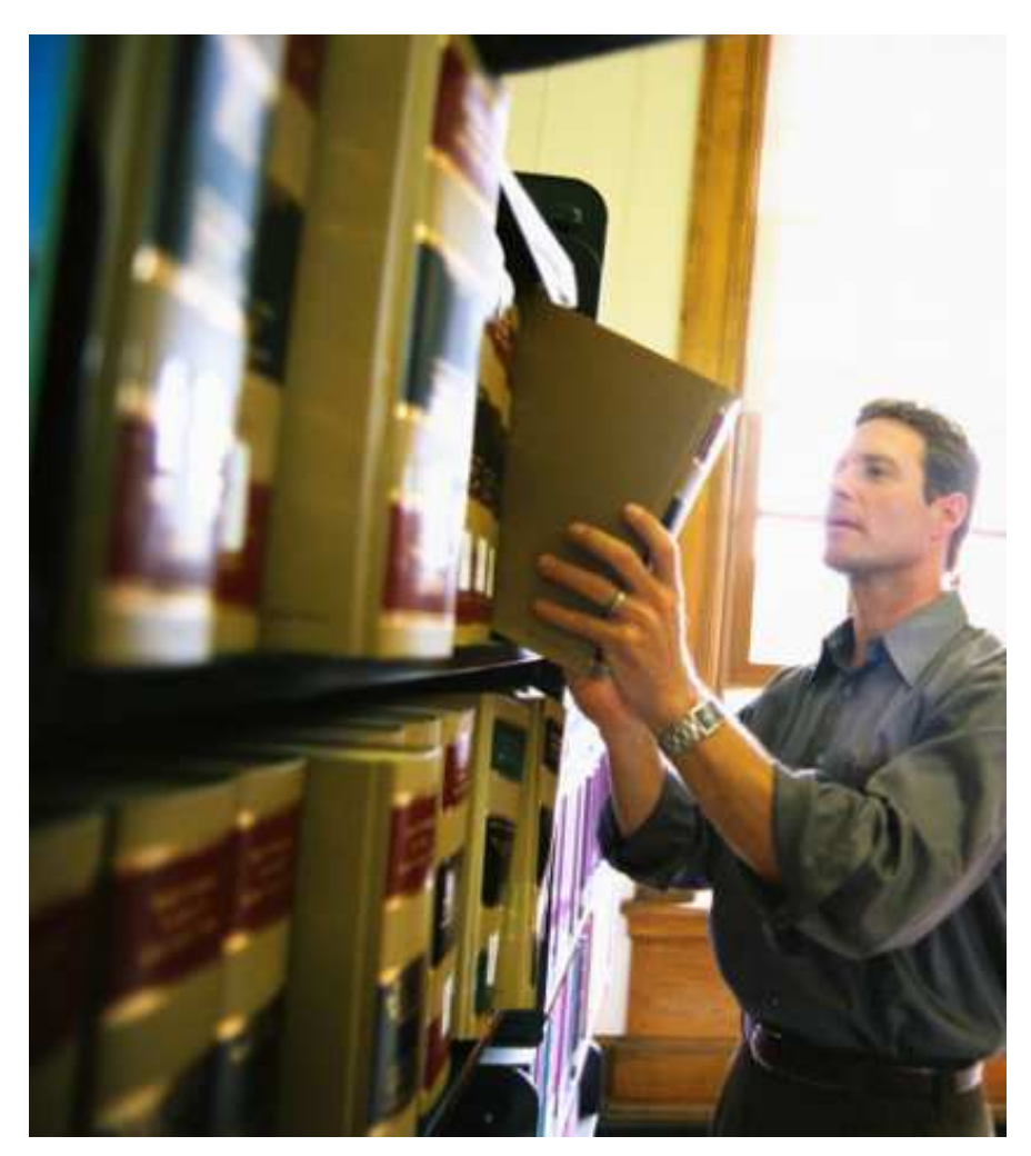
February 2013 Slide 10