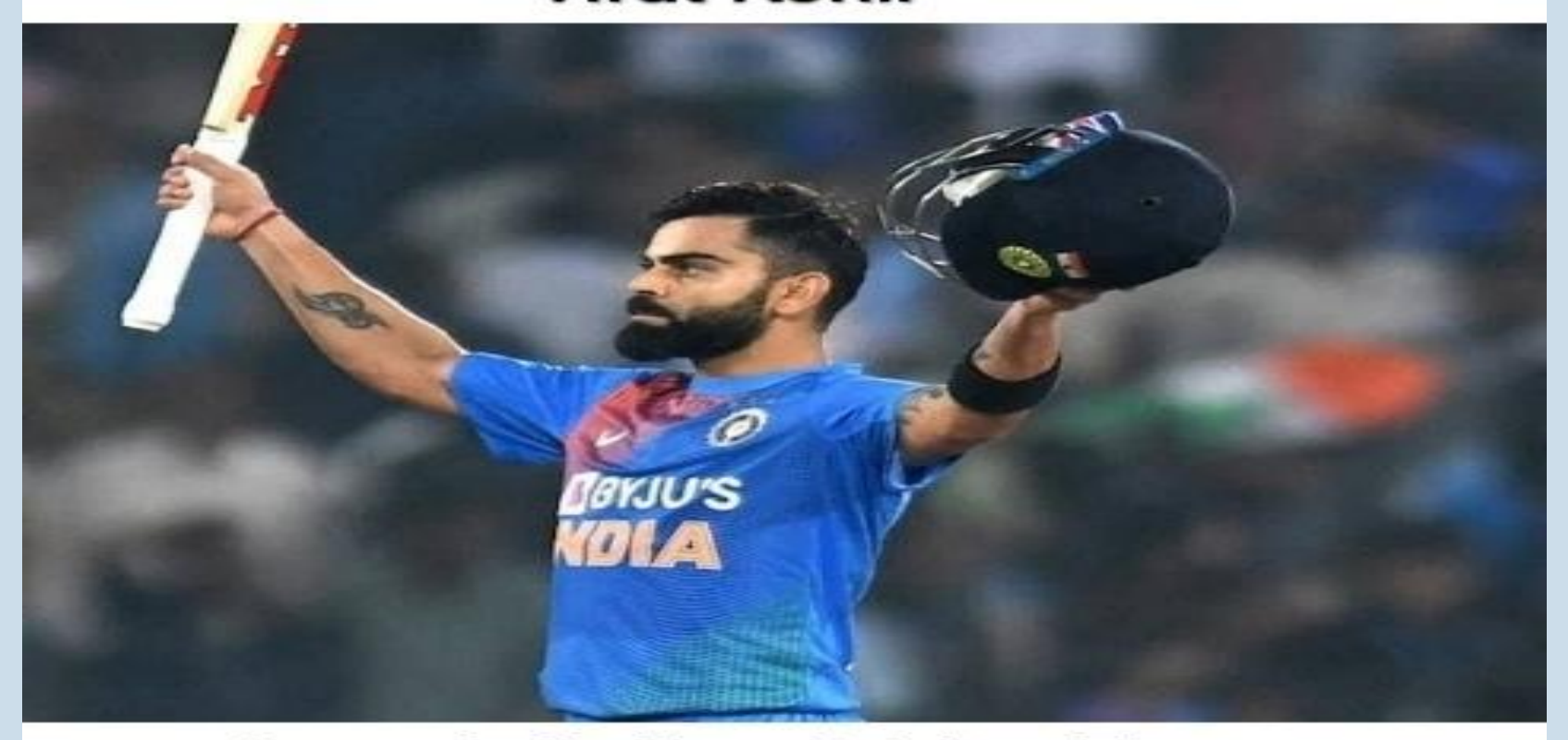
Captain Indian Cricket Team