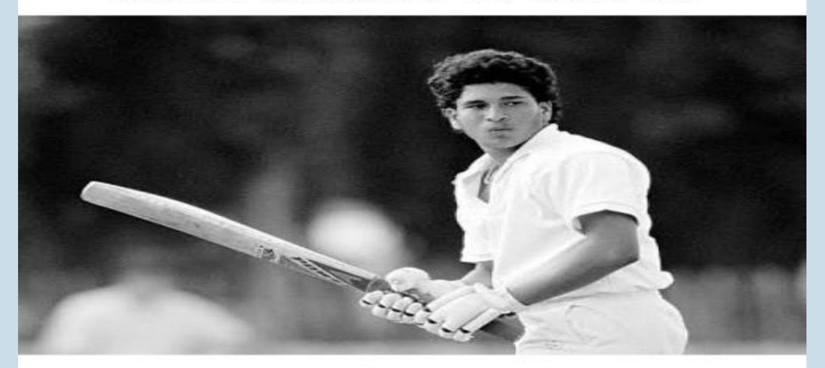
Test Debut Nov 1989