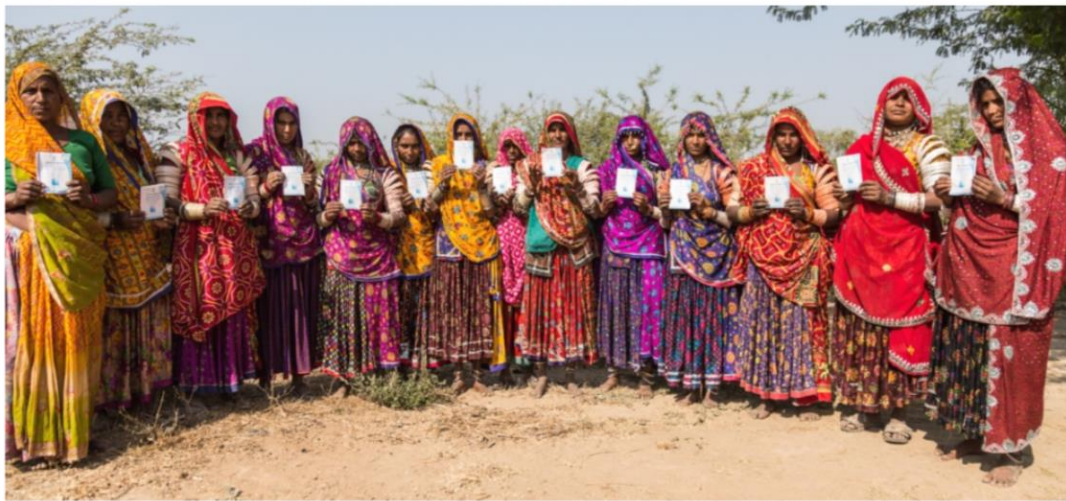
Human Rights: Ration Card, Voting Card etc.