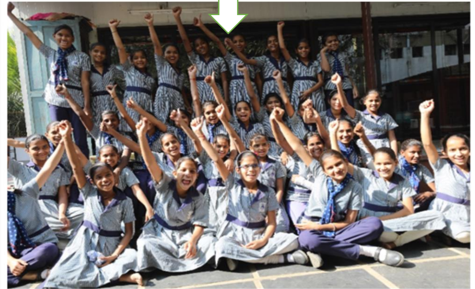
Nomadic kids from tent schools to reputed schools in Ahmedabad.