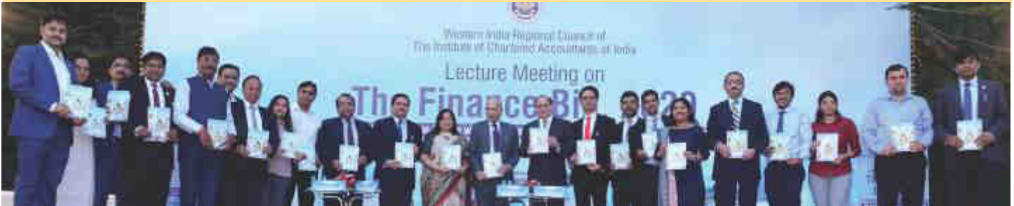
Union Budget 2020 - An Analytical Overview