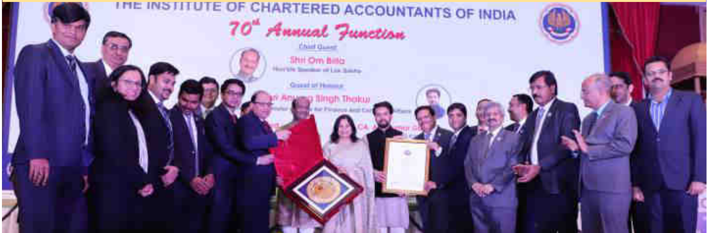
Best Region Award Received by Team WIRC 2019 by Chief Guest Shri Om Birla, Hon'ble Speaker of Lok Sabha, Guest of Honour Shri Anurag Singh Thakur, Minister of State for Finance and Corporate Affairs, at New Delhi