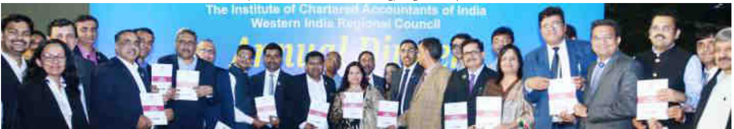
Tally for Professionals