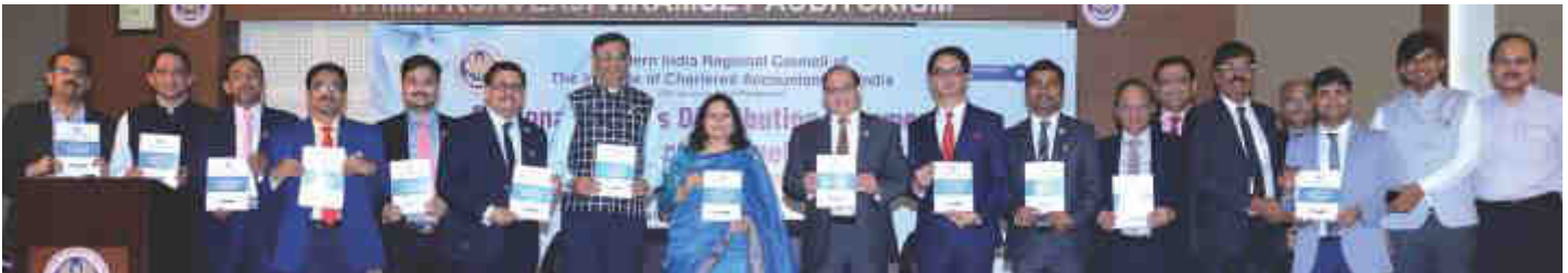
e-Handbook on Role of Chartered Accountancy Firms to ensure compliance with Securities and Exchange Board of India (Prohibition of Insider Trading) Regulations, 2015