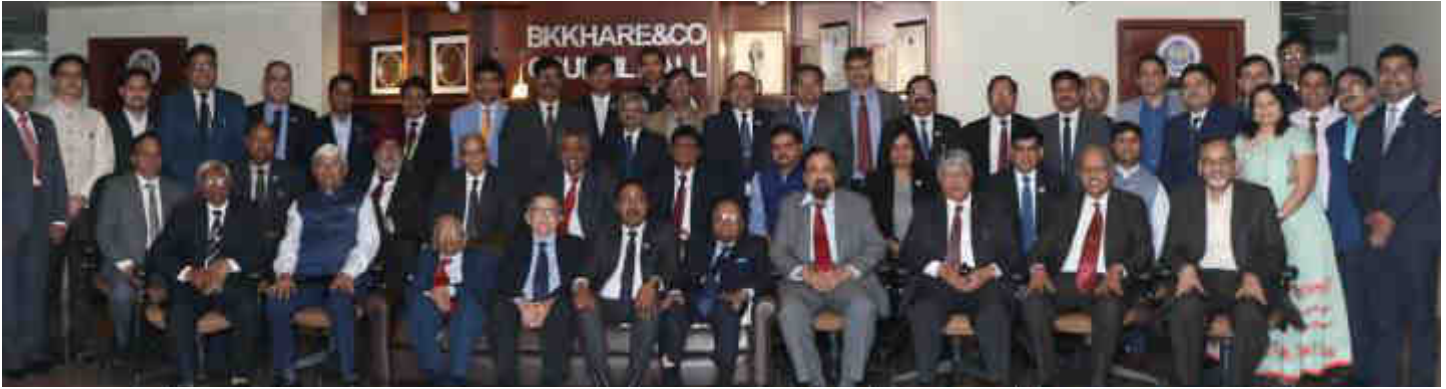
Group Photo taken on Interactive Meeting with Past President on the Consultation Paper issued by MCA on Enhancement of Audit Independence & Accountability