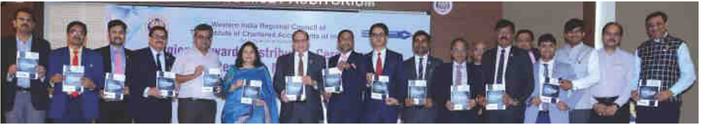
Forensic Audit / Transaction Audit Under IBC