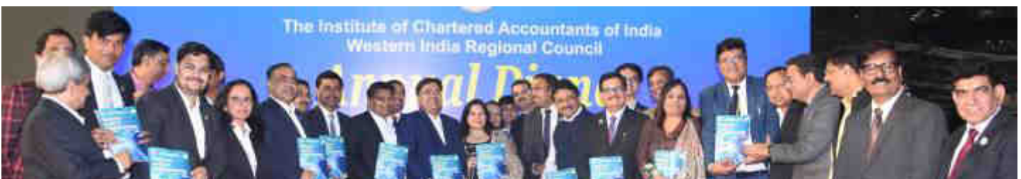
Statutory Audit of Bank Branches