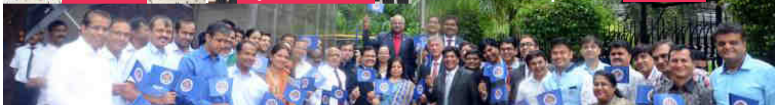
CA Day Celebration Week