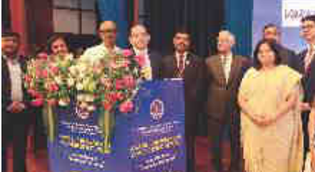
Launch of Revamped WIRC Website