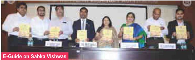
E-Guide on Sabka Vishwas