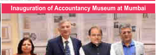
Inauguration of Accountancy Museum at Mumbai