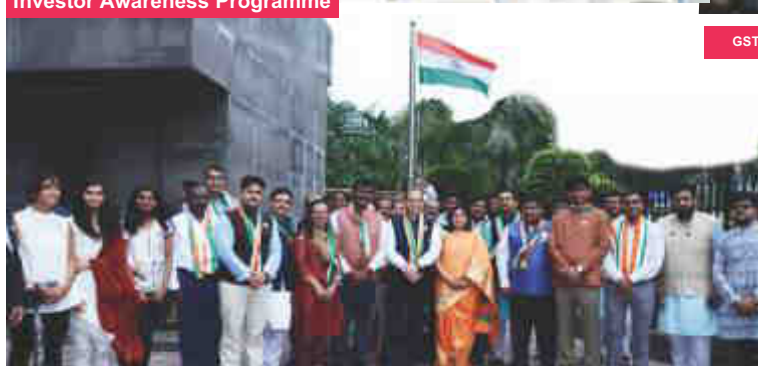
WIRC Celebrates Independence Day at ICAI Tower, BKC, Mumbai