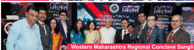
Western Maharashtra Regional Conclave Sangli