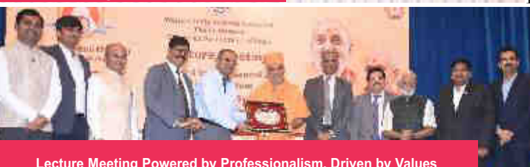
Lecture Meeting Powered by Professionalism, Driven by Values