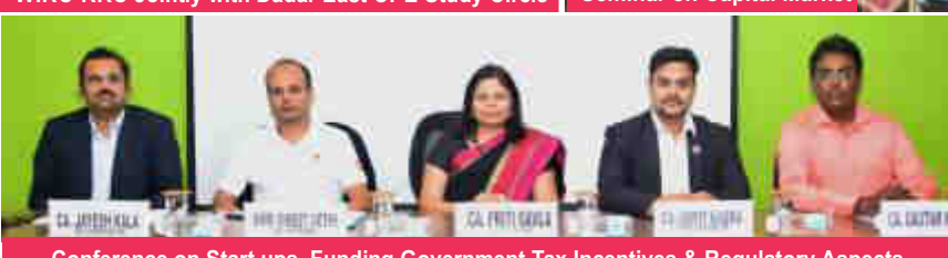
Conference on Start ups, Funding Government Tax Incentives & Regulatory Aspects