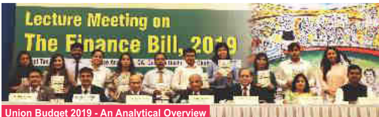
Union Budget 2019 - An Analytical Overview