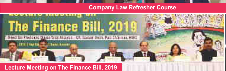
Lecture Meeting on The Finance Bill, 2019