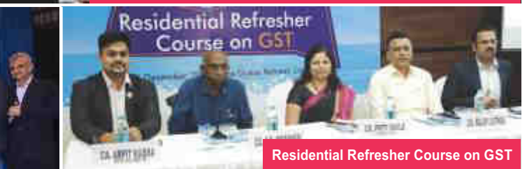
Residential Refresher Course on GST