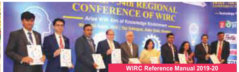
WIRC Reference Manual 2019-20