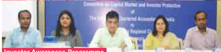
Investor Awareness Programme