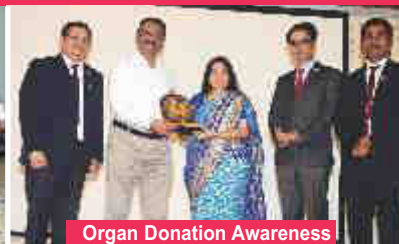
Organ Donation Awareness