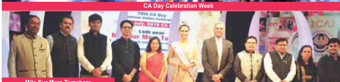
Mile Sur Mera Tumhare