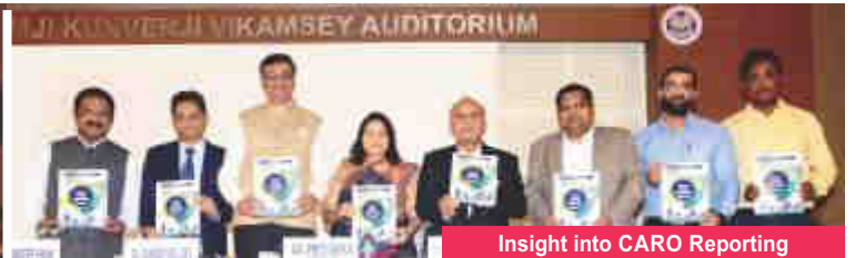
Insight into CARO Reporting