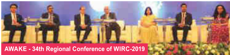
AWAKE - 34th Regional Conference of WIRC-2019