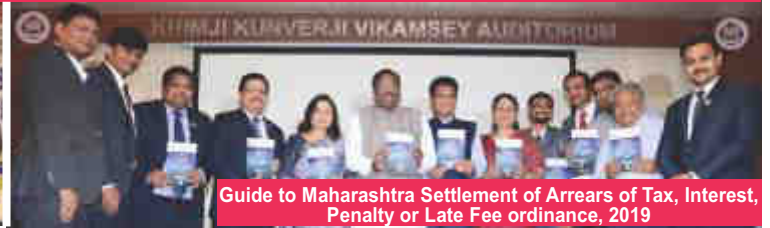
Guide to Maharashtra Settlement of Arrears of Tax, Interest, Penalty or Late Fee ordinance, 2019