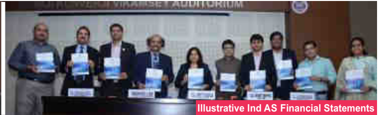
Illustrative Ind AS Financial Statements