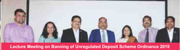
Lecture Meeting on Banning of Unregulated Deposit Scheme Ordinance 2019