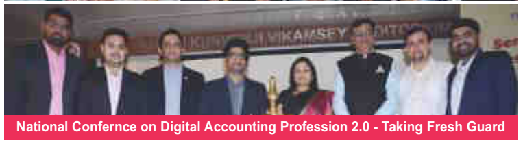
National Conference on Digital Accounting Profession 2.0 - Taking Fresh Guard