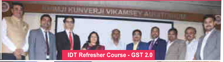
IDT Refresher Course - GST 2.0