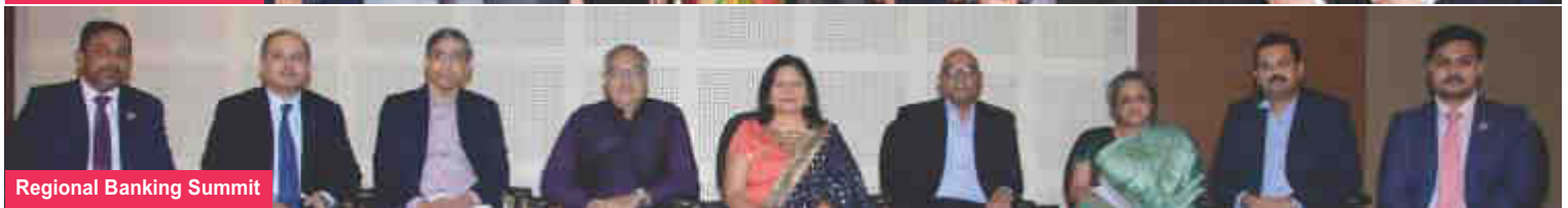
Regional Banking Summit