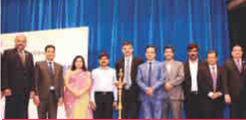
Direct Tax Refresher Course - DTRC