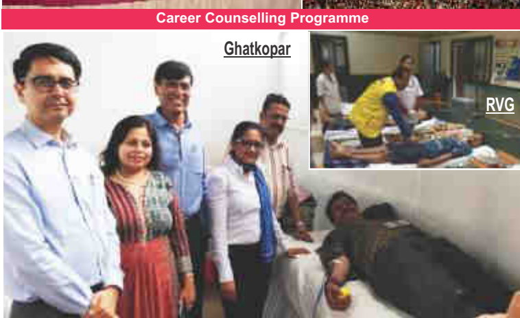
Blood Donation Camps in Mumbai