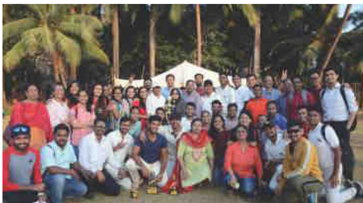
Winner - C. M. Gabhawala & Co.