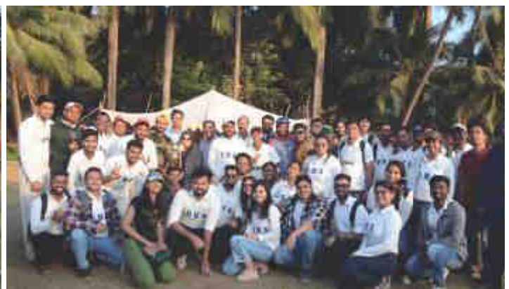
Runner up - R. M. Ajgaonkar & Associates