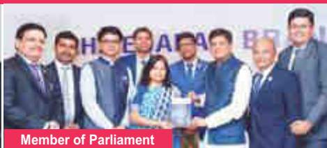
Member of Parliament