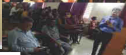
GST Session for Girl Students at Various Colleges in Mumbai