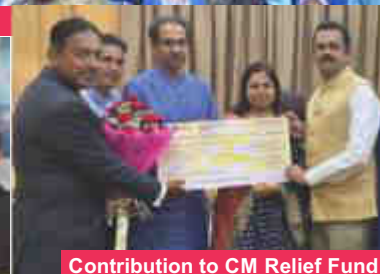
Contribution to CM Relief Fund