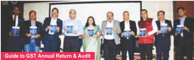
Guide to GST Annual Return & Audit