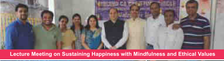
Lecture Meeting on Sustaining Happiness with Mindfulness and Ethical Values