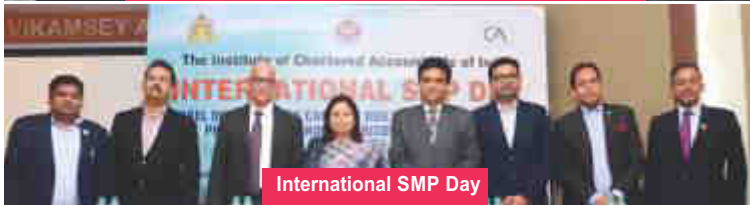
International SMP Day