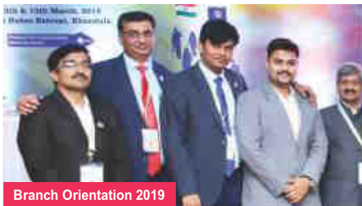
Branch Orientation 2019