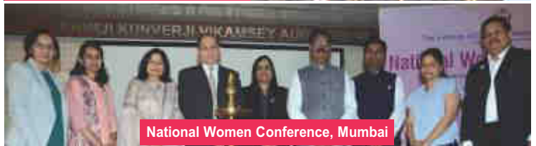
National Women Conference, Mumbai