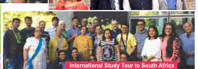
International Study Tour to South Africa