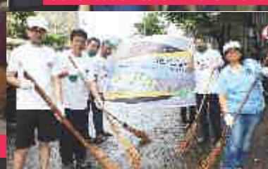
Swachh Bharat Abhiyan