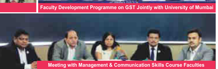
Meeting with Management & Communication Skills Course Faculties