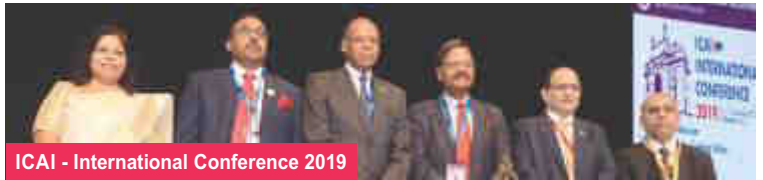
ICAI - International Conference 2019