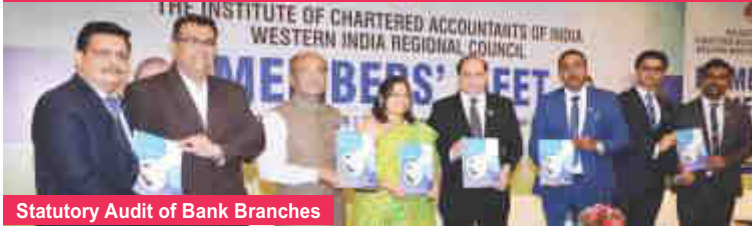
Statutory Audit of Bank Branches