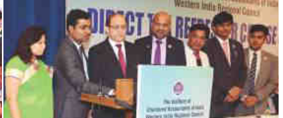
Launch of WIRC - Online GST Help Desk