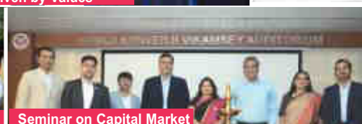
Seminar on Capital Market