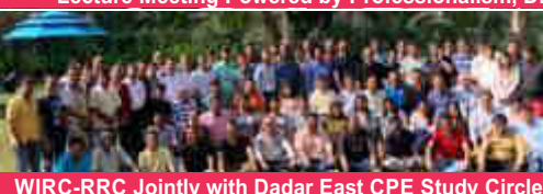
WIRC-RRC Jointly with Dadar East CPE Study Circle