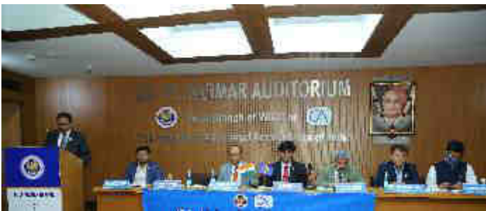
Inaugural of SRC & Launch of Pune ICAI Website