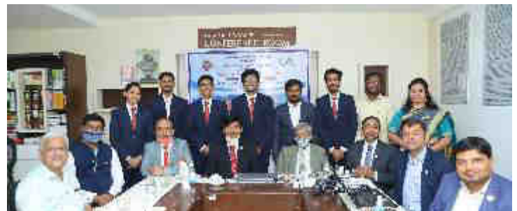
Interactive Meeting with Team Pune WICASA