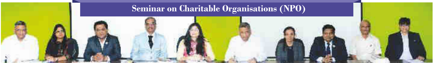
Seminar on Charitable Organisations (NPO)