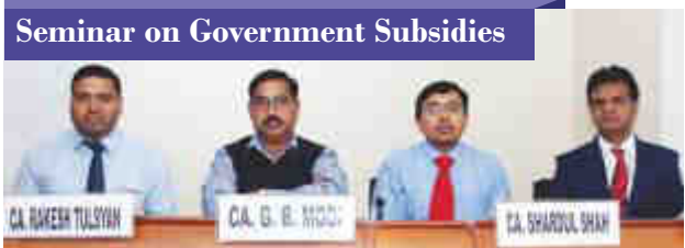
Seminar on Government Subsidies