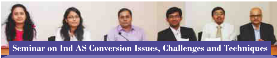
Seminar on Ind AS Conversion Issues, Challenges and Techniques