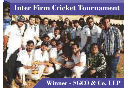
Inter Firm Cricket Tournament