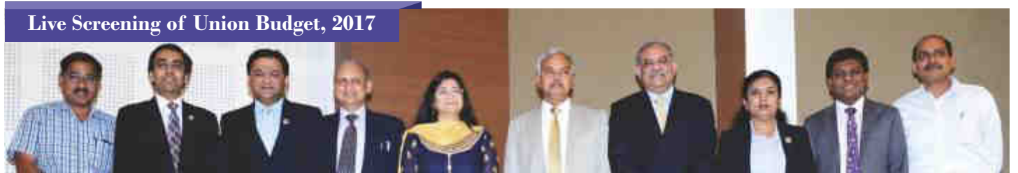
Live Screening of Union Budget, 2017