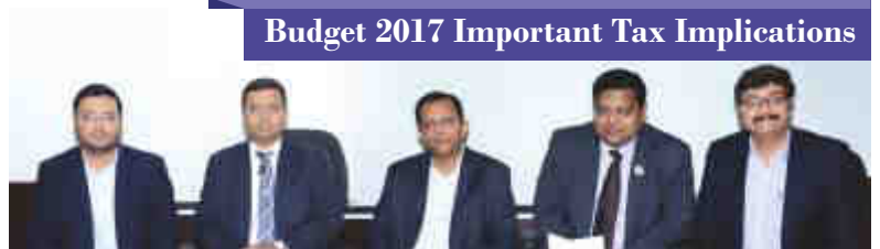
Budget 2017 Important Tax Implications