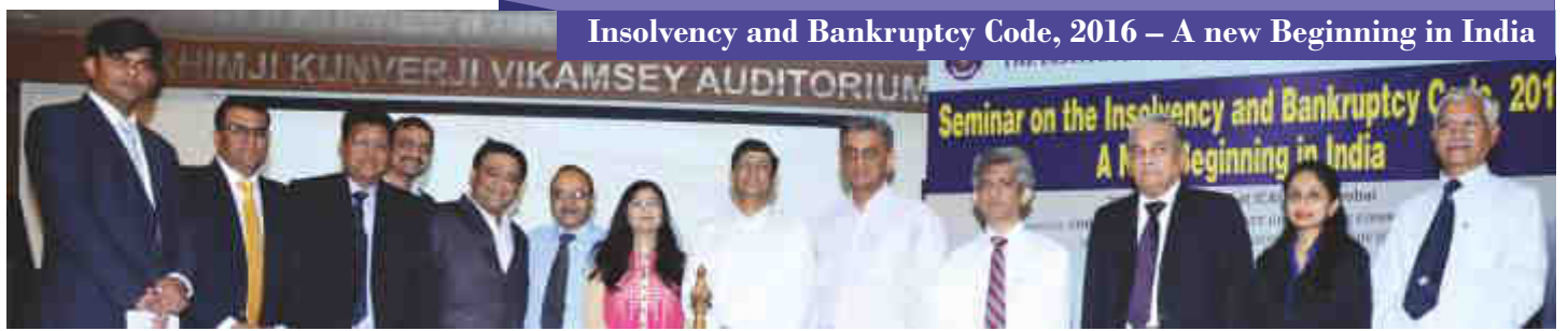
Insolvency and Bankruptcy Code, 2016 – A new Beginning in India