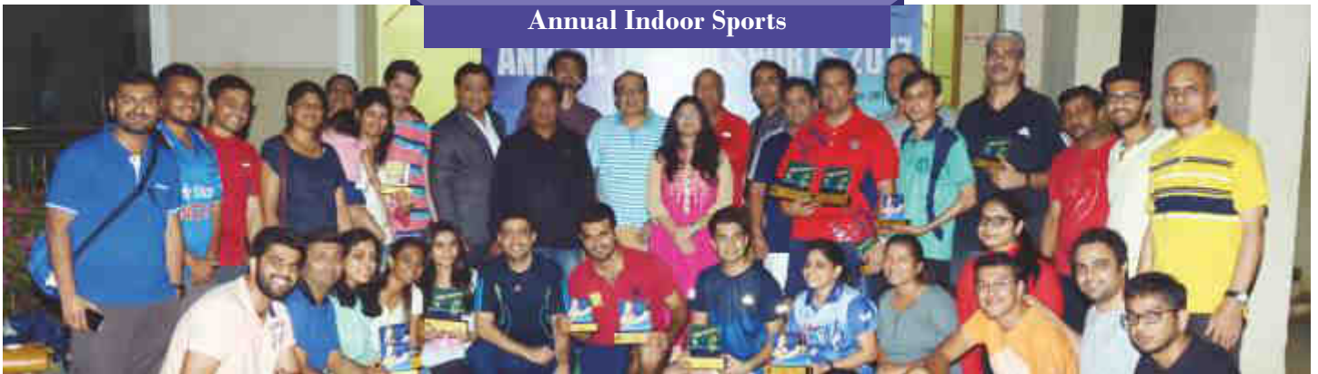
Annual Indoor Sports