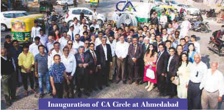
Inauguration of CA Circle at Ahmedabad