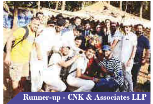
Runner-up - CNK & Associates LLP