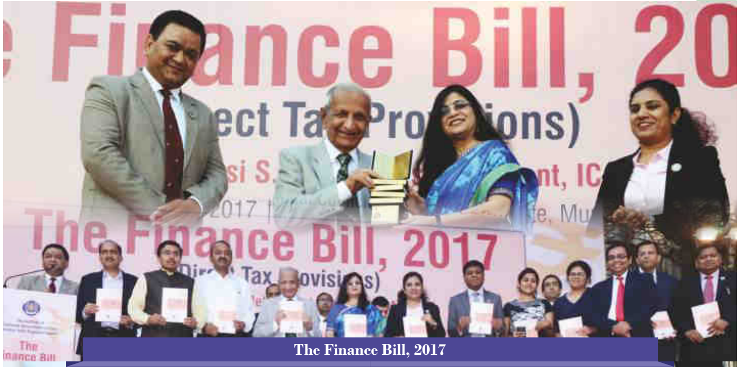
The Finance Bill, 2017