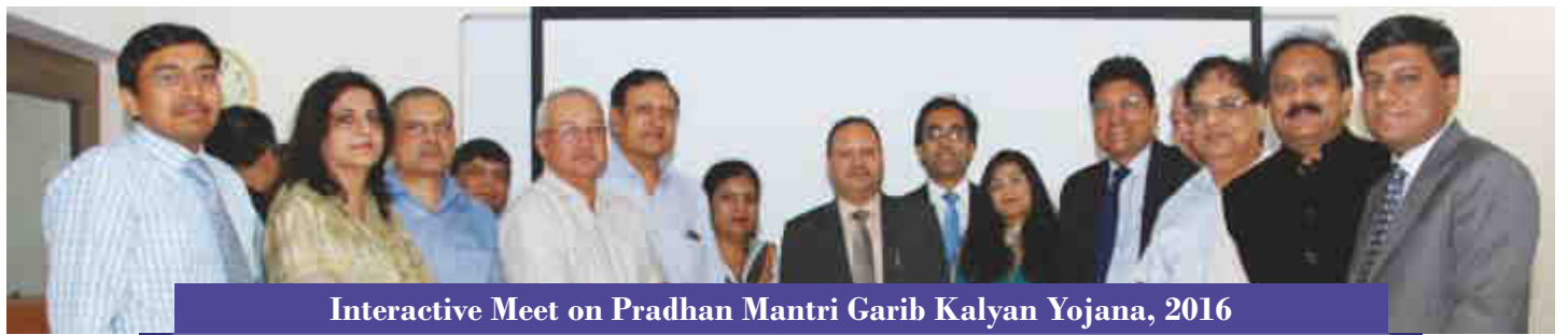
Interactive Meet on Pradhan Mantri Garib Kalyan Yojana, 2016